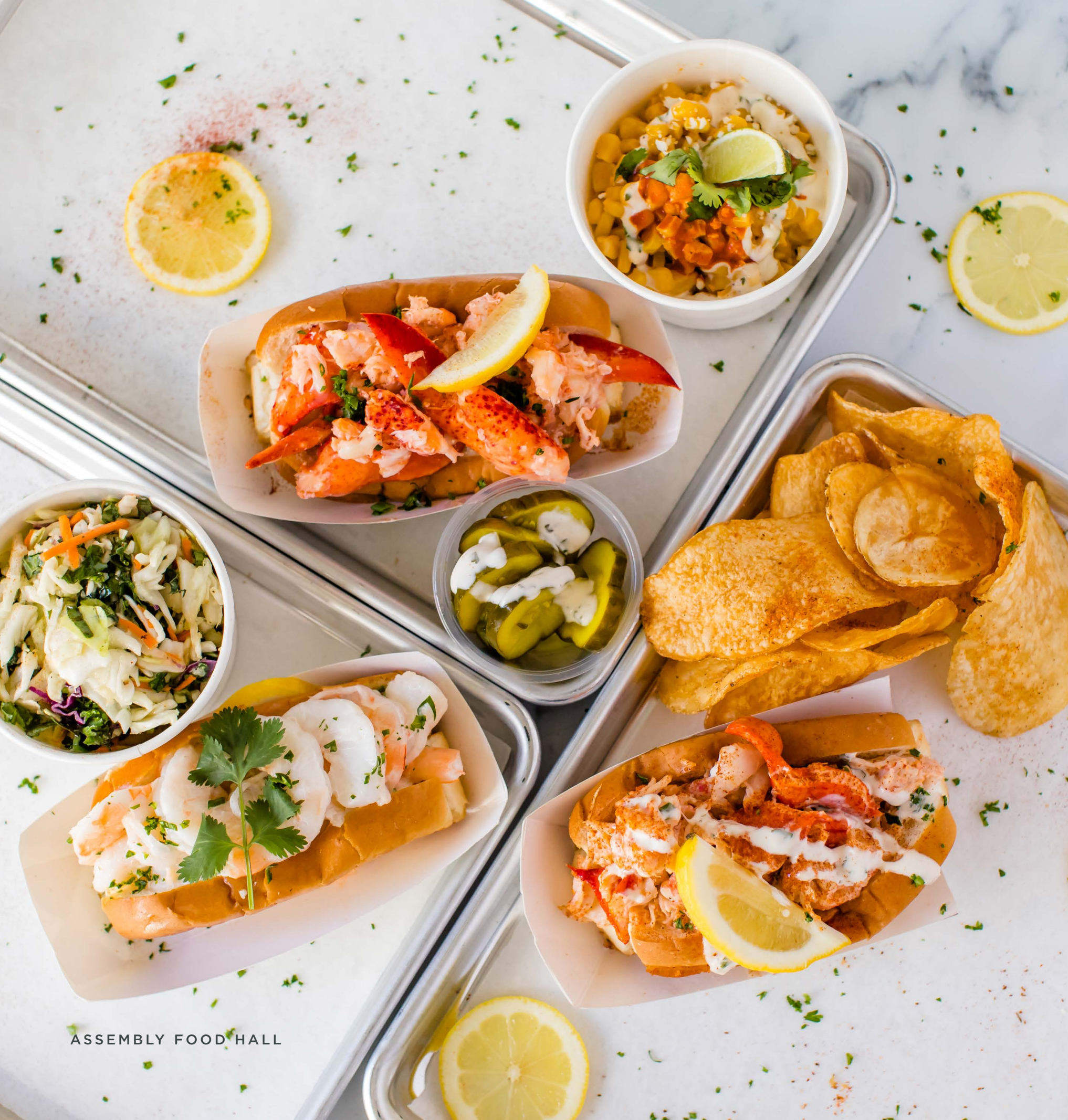
ASSEMBLY FOOD HALL