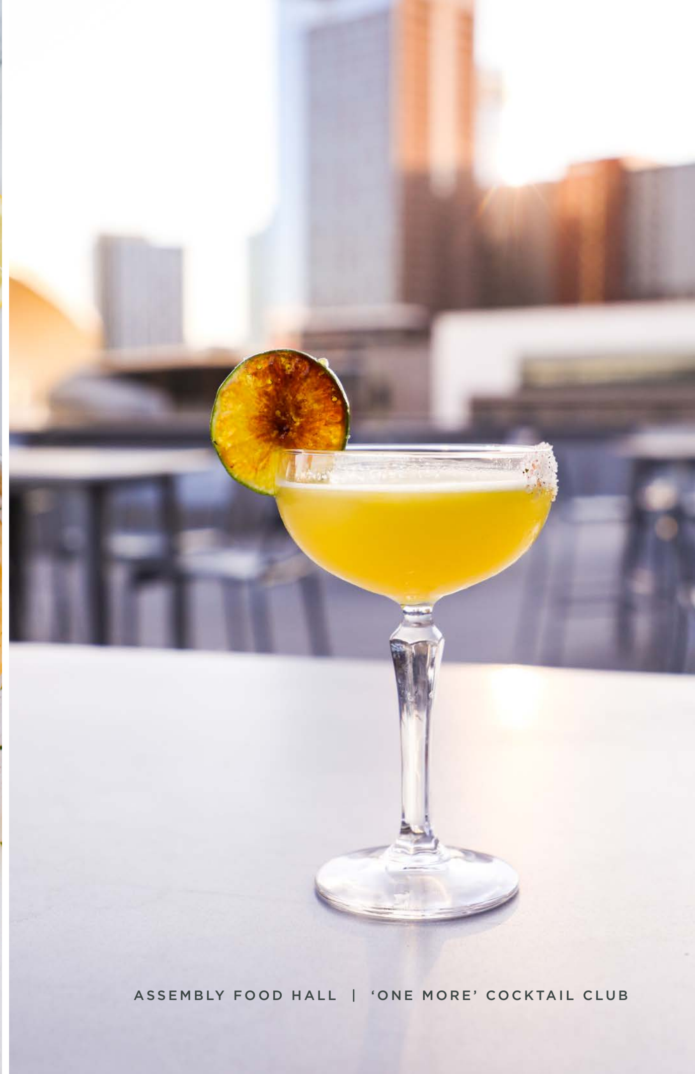
ASSEMBLY FOOD HALL | 'ONE MORE' COCKTAIL CLUB